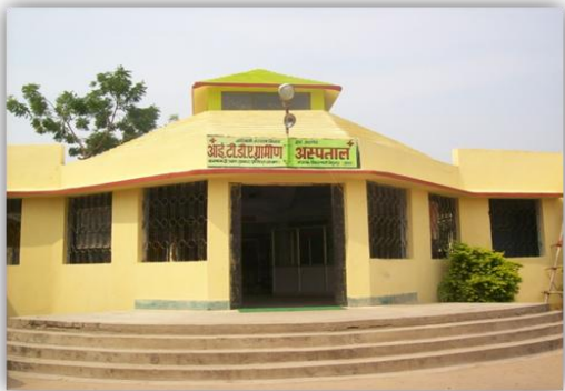
MESO Rural Hospital in East Singhbhum