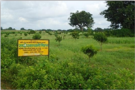
Horticulture Promotion for income enhancement