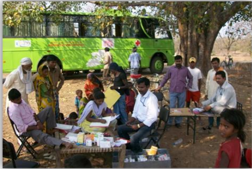
Health camp in remote area through NMMU