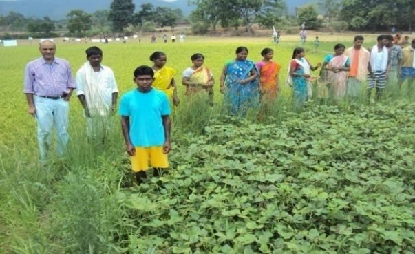
On the spot technical inputs to farmer